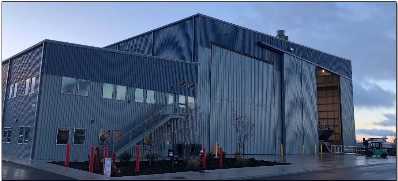
The Port of Bellingham built the 57,000 square foot All American marine boat manufacturing facility in 2017 to create additional marine trade jobs and restore the waterfront economy.