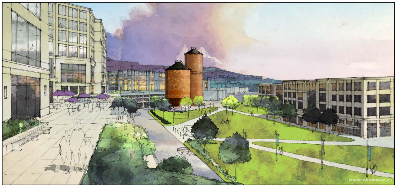
Conceptual Illustration by D2 Group, LLC looking southerly toward Sehome Hill. A public plaza above the proposed Bay Street parking garage will overlook a new park in the Downtown Waterfront area.

The proposed 2018 amendment to the Waterfront District Sub-Area Plan is consistent with these Objectives.